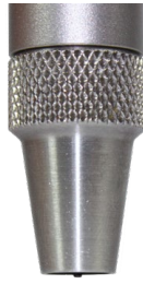
Test head „318“ with test tip