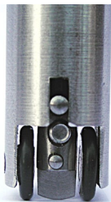
Rolling test head „435 S“ with test tool