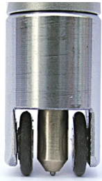
Rolling test head „318 S“ with test tip