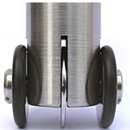
Rolling test head „435“ with test disc